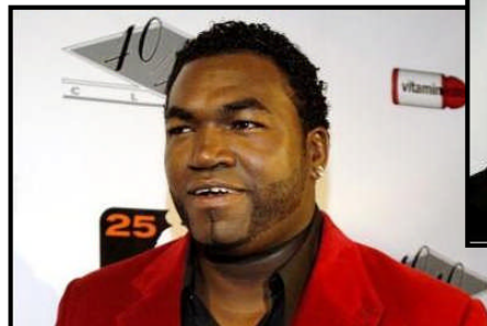
SAN FRANCISCO, CA - July 9, 2007: David Ortiz [RIGHT] and Jesse Jackson [FAR RIGHT] at Barry Bonds and Jay Z's 40/40 All Star Party.