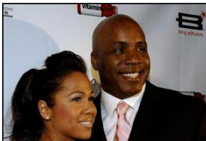
SAN FRANCISCO, CA - July 9, 2007: Barry Bonds and his wife [ABOVE] host Barry Bonds and Jay Z's 40/40 All Star Party.

On Monday, July 9 th 2007, Kai-Kai Sandal became Pure Comfort enough for the "stars"... No, we're not referring to starfish along his beachfront store in Montauk, NY; nor do we mean the bright stars which cast reflections on the midnight sea at Kai-Kai Key West; we mean the 2007 Major League Baseball ALL-STARS!